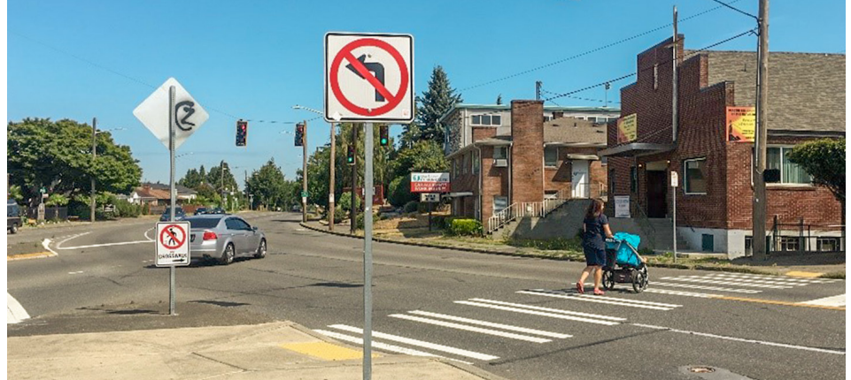
Hagaajinta dhanka badqabka waxaa laga samayn doonaa isgoyska 15th Ave S, S Columbian Way, iyo S Oregon St.

15th Ave S ee u dhaxaysa S Spokane St iyo S Angeline St waxay isku xir muhiim ah siisaa dadka ku safraya dhanka Beacon Hill. Waaxda Gaadiidka (Seattle Department of Transportation, SDOT) waxay hagaajinaysaa marinkan kaasoo isku dheelitiraya baahiyaha dhammaan dadka adeegsanaya si qof kasta uu ugu heli karo halka uu doonayo inuu ku aado si aamin ah oo fudud.